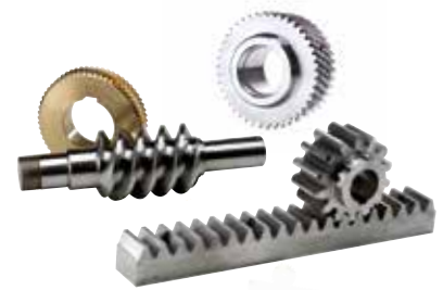
Gear wheels and racks