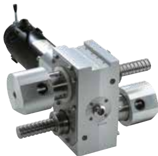
Double acting worm gear screw jacks with ball screw, servo motor and brake