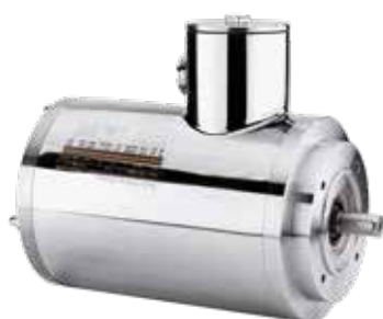
Stainless steel motor