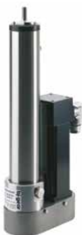
Actuators based on toothed belt drive in stainless steel and in a hygienic design