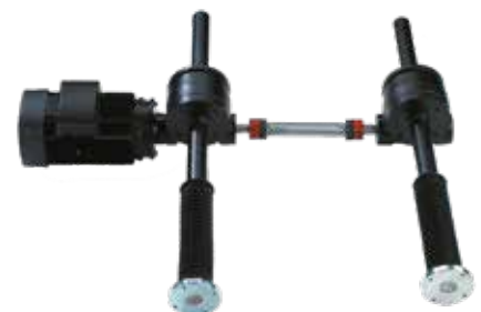
Two worm gear screw jacks assembled for synchronous movement