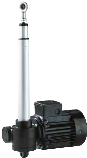
ATEX approved actuator based on a worm gear drive. The actuator is mounted with cylindrical aluminium tubes and an inner threaded spindle