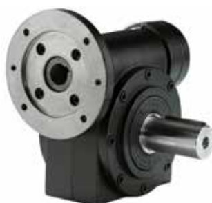
Worm gearbox of cast iron