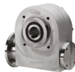
Standard stainless steel worm gearbox