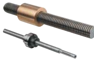
Acme threaded spindles

BJ-Gear A/S is certified according to DS/EN ISO 9001 and we use advanced CNC machining and measuring machines ensuring high precision and flexibility in our production.