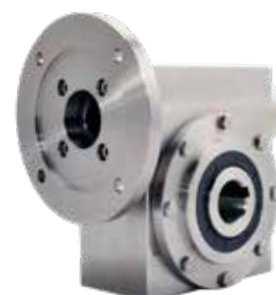
Standard stainless steel worm gearbox