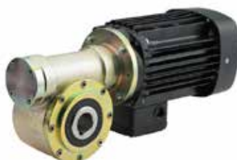
Yellow chromated worm gearbox with motor