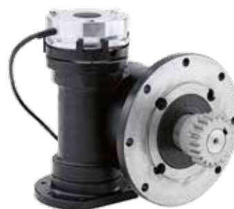
Worm gearbox with special motor flange, output flange and brake