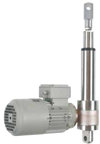
Actuator with inner and outer tubes in stainless steel