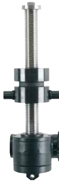
Worm gear screw jacks with ball screw spindle and a special nut