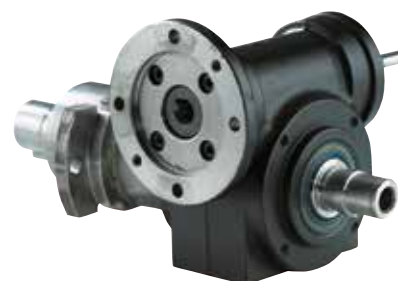
Worm gearbox with special output shaft and flange