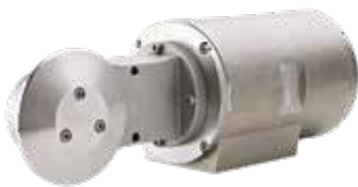
Stainless meat cutting saw with stainless AC motor