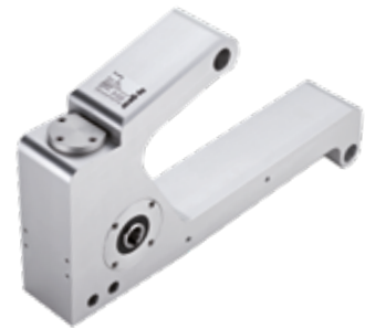
Special gearbox solution integrated in a lever arm