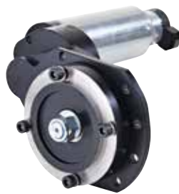
2-step helical gearbox with DC motor, brake and encoder