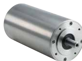
Stainless steel servo motor