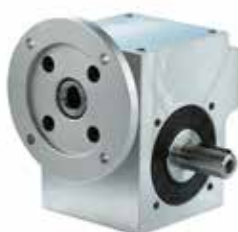
Standard aluminium worm gearbox with output shaft and flange