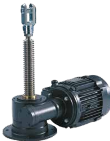
Worm gear screw jack converts a rotary motion into a linear motion with three to four times higher efficiency than other worm gear screw jacks