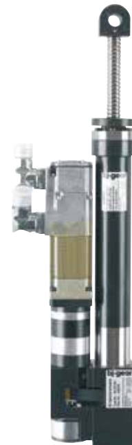
Compact inline actuator with planetary gearbox and servo motor