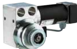
Highly efficient worm gearbox with DC motor and clutch