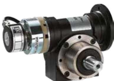
Worm gearbox with special worm shaft for brake and encoder and special output flange