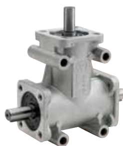
Right angle gearboxes

The planetary gearboxes are typically applied for servo solutions and positioning tasks and are available as straight or angle planetary gearboxes.