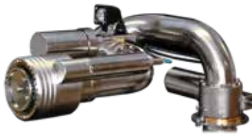
Stainless steel water cannon with 3 special geared motors