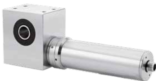
Stainless worm gearbox with a special motor flange for DC motor and a stainless motor shield