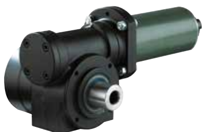
Worm gearbox with special motor flange, output shaft and reduced backlash