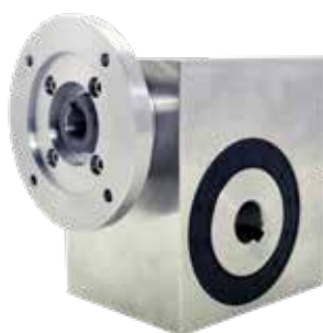
Premium stainless steel worm gearbox