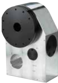
Worm gearbox with double reduction and high safety factors

We ensure a competent delivery from the conception of design and production to delivery of the prototype and subsequently the delivery of the finished product. Our flexible RandD department and our modern production facilities ensure swift production of any special gearbox and actuator at a reasonable price, even in small numbers.