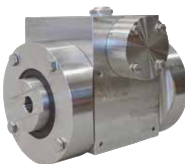
Integrated stainless steel worm gearbox with enhanced bearings and special output shaft