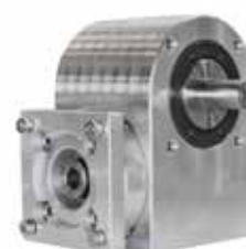
Aluminium worm gearbox with special motor flange and output shaft