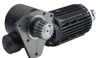
Worm gearbox with special output shaft and flange